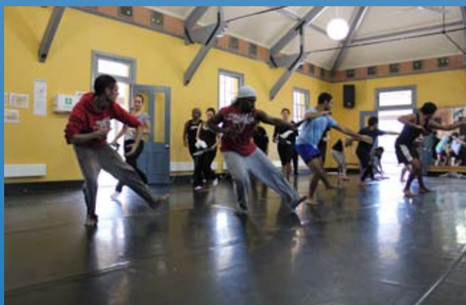
Students practice "Koiki"